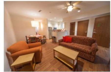
Common room in one of our TLC apartments. Three young women share an apartment, but each has her own bedroom.

Our TLC program provides a stable home environment for young women ages 18-24. 2016 marks the first full year of two operating TLC sites — Beazley House , our designated historic home, and Pauline's Place , our new home completed in 2015 (featured on cover). Both sites welcome a client with a shared apartment, including a kitchen, common room, common bathroom, and her own bedroom. Site managers live in each of the homes to provide extensive case management and a weekly meeting with each young woman in the program.