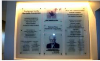
Dedication wall inside Pauline's Place.